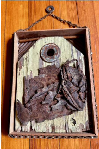
Bird House Mixed Media, 12.5" x 7.5" NFS