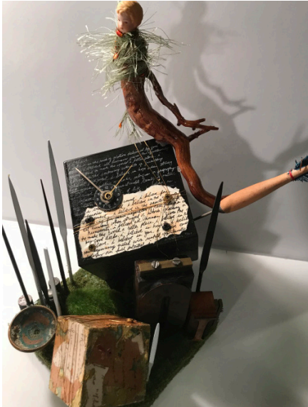
Wherever Life Leads You Multi Element Assemblage, 8" x 10" x 8" $750