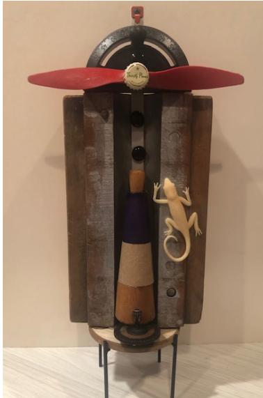
Thirsty Planet Wood, Plastic, Cardboard, Glass, 19.75", 7.25", 3" $400