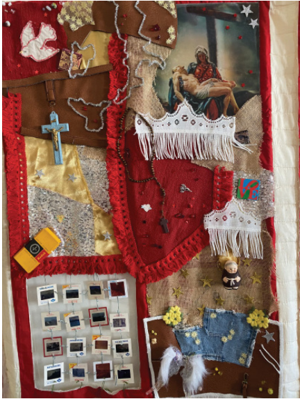
Quilt Panel for Paul and Roger Assemblage, 3' x 6' NFS IG: @laurengotard