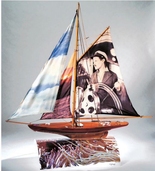
The Sojourner Mixed Media, 36" x 36" x 12" NFS www.williamgrabowski.com