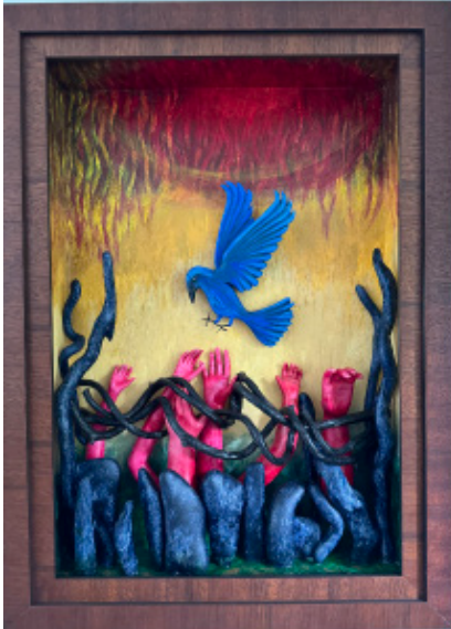
Bird of Fire Wood, Ceramic, Metal, Four Ply Board, 15.5" x 21.5" x 4" NFS