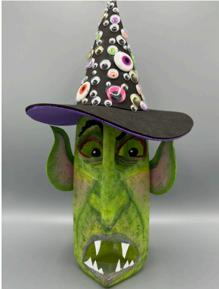
Eye of Providence Wicked Witch Juice Container, Acrylic Paint, Foam, 13" x 6" NFS www.etsy.com/shop/garishrubbish