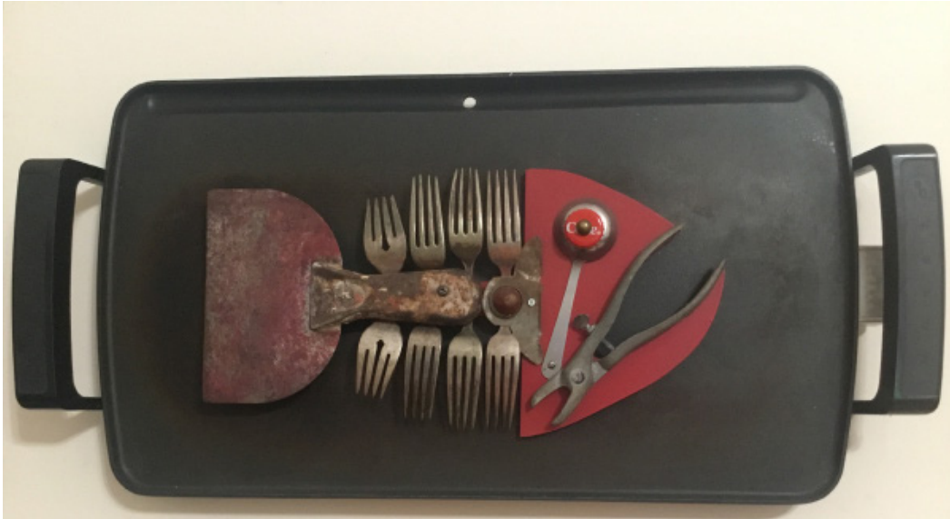
Fish Fry Assemblage, 25" x 12" x 3" $650