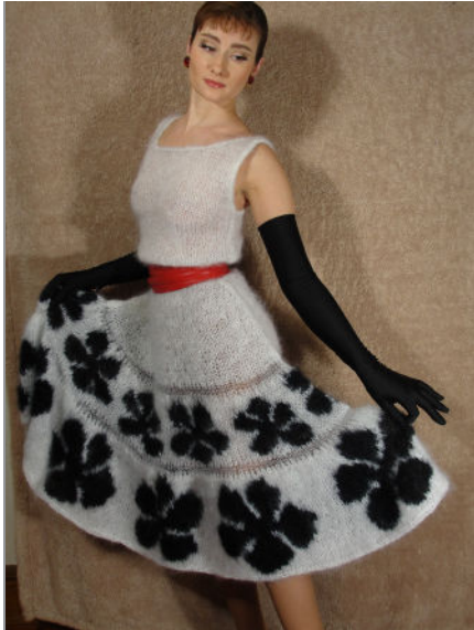
Audrey Dress Knitted Dress, 45" $690