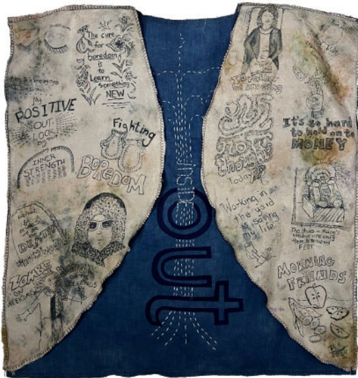
Inside Out (Wisdom Vest) Silk and Cotton, 22" x 21" $650.00