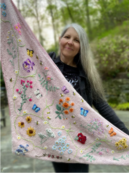
Garden Party Shawl Wool, 60" x 25" NFS