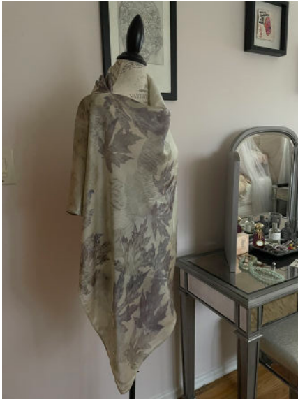
Eco Printed Shawl Eco Printed Silk, 27" x 27" $400