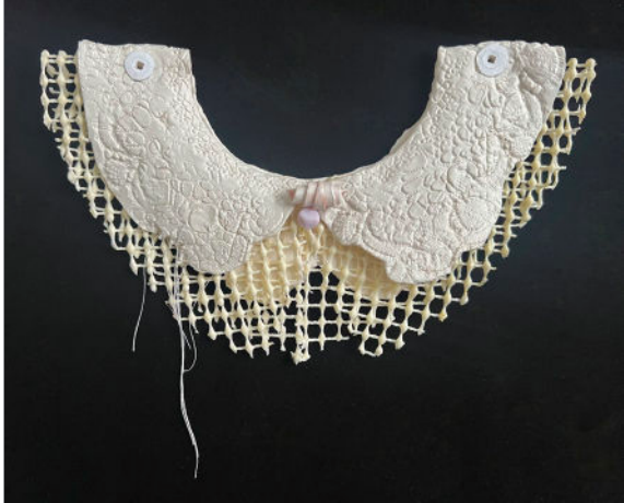
Great Grandma's Collar Clay and Rubber, 10" x 4" NFS