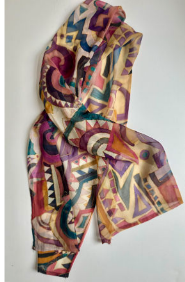
Doodle Scarf Hand Painted Silk, 8" x 40" $200.