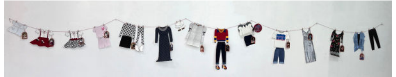
Common Thread (A Visual Autobiography) Paper and String, 120" x 18" NFS