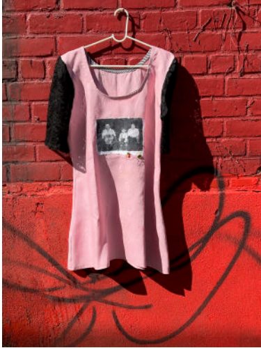
Family Map Cloth, 19" x 33" $300