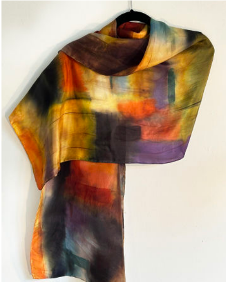
Abstract Brown Gold Black Silk Scarf Hand Painted Silk with dyes, 22" x 70" $120.