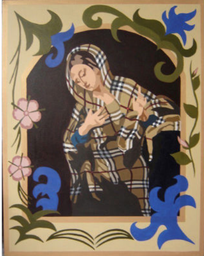
Burberry Madonna Acrylic on Canvas, 28" x 22" $300