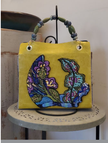
Floral Handbag Mixed Media, 10" x 13" x 2" $225