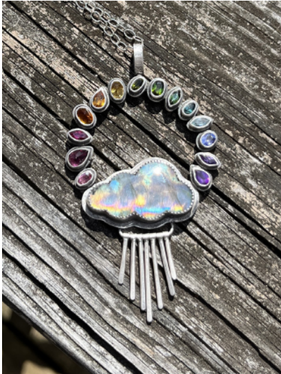
Rainbow Cloud Necklace Jewelry, 3" $978