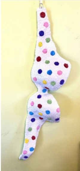
Polka Dot Bra 3D Mosaic Sculpture, 27" x 6" x 5" $500