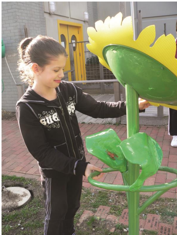
Young visitor at the Long Island Children's Museum

The Huntington Arts Council is proud to manage the Decentralization grant program, which fosters the arts by funding opportunities for Nassau- and Suffolk-based nonprofit arts organizations, individual artists and teaching artists.