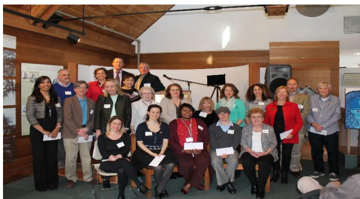
Suffolk County Decentralization recipients pose for a photograph at the 2017 Grants for the Awards Ceremony held at the Walt Whitman Birthplace Association in Huntington Station